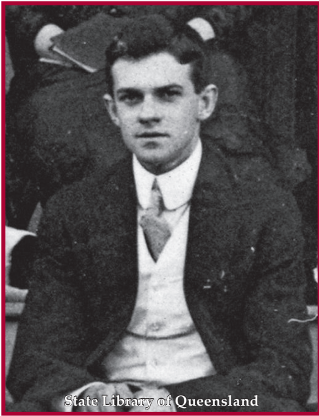
State Library of Queensland

The School Magazine of June 1917 published: