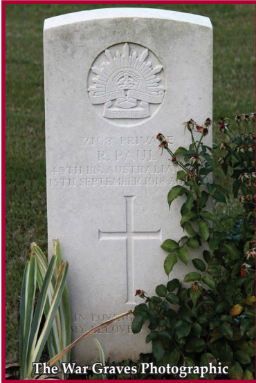
The War Graves Photographic