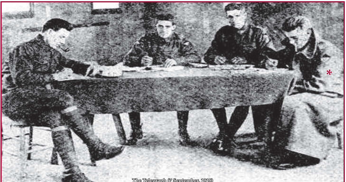
The Telegraph (7 September, 1918)